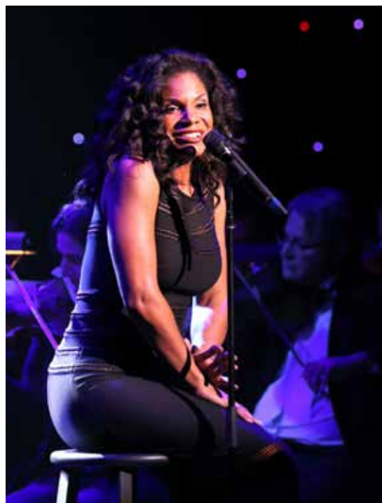
Audra McDonald

Show Sponsors help bring the world's finest performers to the Coachella Valley by underwriting productions with one-time gifts of $10,000 to $50,000. In appreciation, they are recognized in association with the performance and receive 20 premier orchestra seats for themselves and their guests, a private party in the Founders Room and a Meet & Greet with the artists, when protocols allow.