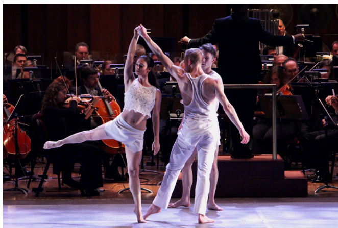
Keigwin + Company appears Feb. 5.